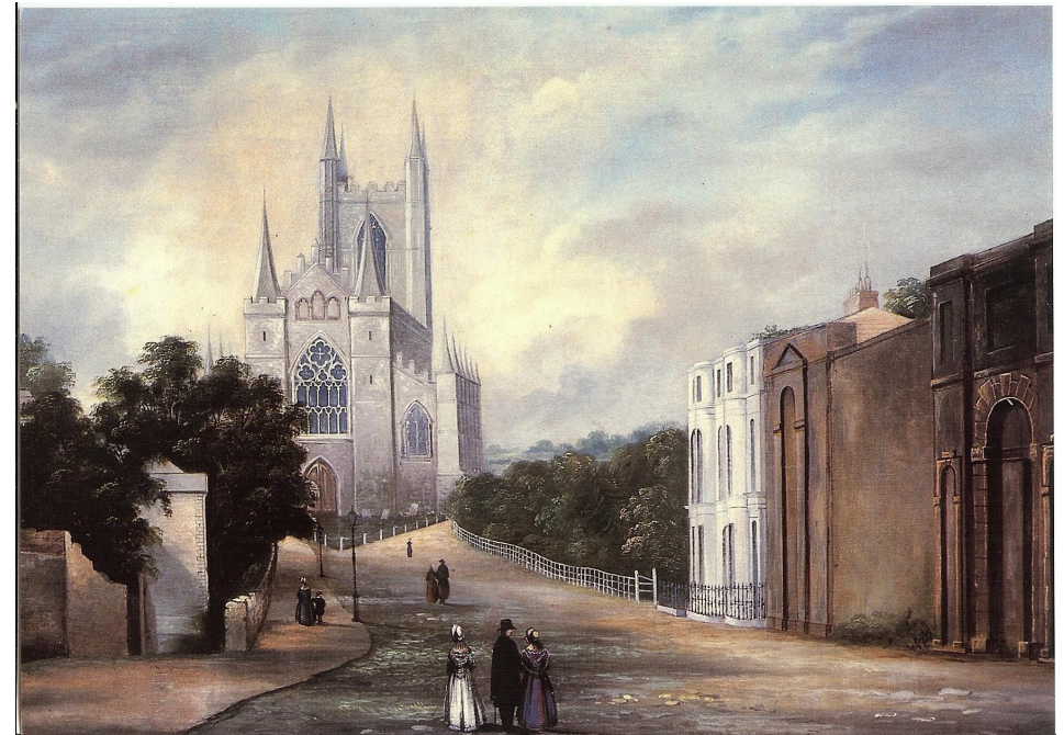
Oil Painting, The Mall, Downpatrick, County Down by Thomas Semple, 1863.