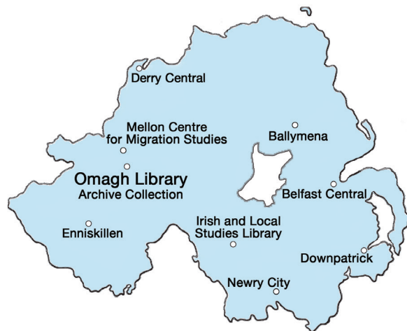
Heritage libraries in Libraries NI

On the afternoon of Saturday 15 August 1998, at approximately 3:10pm a car bomb exploded in Market Street, Omagh, killing 29 people and two unborn children, as well as injuring some 370 people. It remains the largest loss of life of any single incident in the history of the Northern Ireland Troubles.